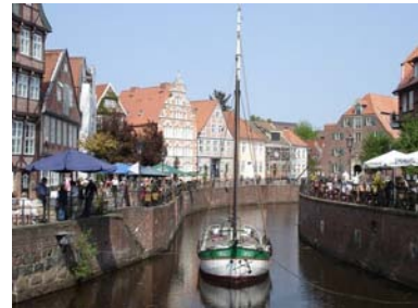
Parts of Stade's town center

The Vincent-Lübeck-Gymnasium is a „Gymnasium“ in the town of Stade, which is situated around 50 km west of Hamburg, Northern Germany. A “Gymnasium” forms part of the German secondary school system in which the students are separated into ability levels from 5 th grade onwards. “Gymnasiums” are responsible for the training and education of fast learners, preparing them for the final exam called “Abitur” which is normally taken after 12 th grade and which allows students to study at a German university.