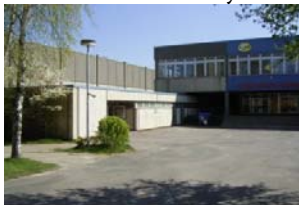
Today's school building... from the outside

17 years later, in 1974, the school moved to its present location at Glückstädter Straße 4. This became necessary due to renewed space problems, attributed to the fact that in the preceding years the school had been turned into a coeducative Gymnasium, now allowing girls and boys to do their Abitur. Today's school name “Vincent-Lübeck-Gymnasium” was granted in 1994.