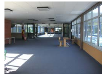
...and from the inside

In upper secondary (10 th to 12 th grade), students choose elective and compulsory subjects, thereby further specialising in their so called “profiles”. The Vincent-Lübeck-Gymnasium (or VLG, as many people call it) is officially a half day school. For the majority of students, school starts at 8.10h in the morning and finishes at 1.30h in the afternoon. However, due to the reduction of regular Gymnasium attendance from 13 to 12 years, afternoon schooling becomes normal for an increasing number of students.